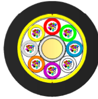
8 Elements Cable