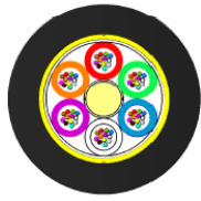
6 Elements Cable